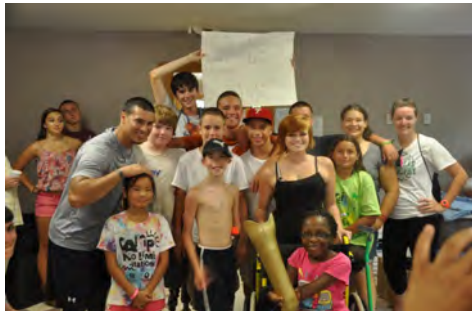
The "Golden Leg Award" was awarded to the Team with the highest point count at the end of camp

At long last, the announcement everyone wants to hear. The decision was tough, numbers had to be crunched, counted, recounted, and re re counted! The 2012 Camp Olympics winner of the Golden Leg is... Drum roll please... The White Ninjas!!!